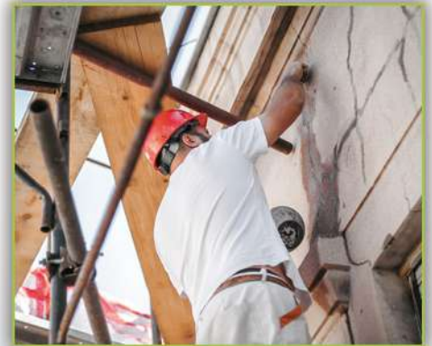
Renovations & Upgrades