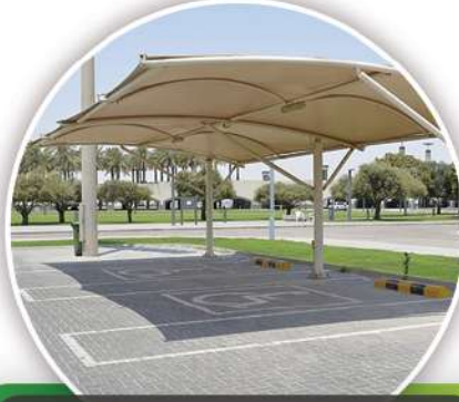
Parking lots & Shade