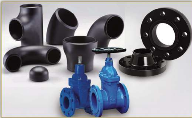
Mechanical & Piping Material