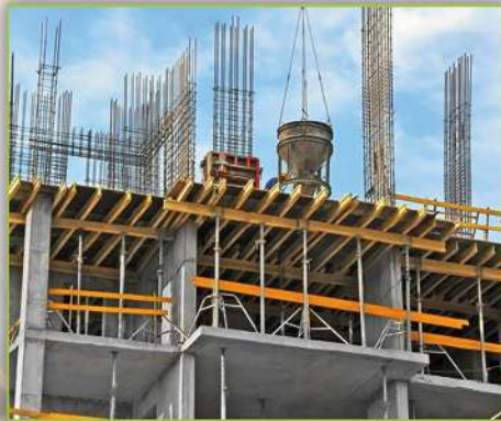
Commercial & Industrial Construction