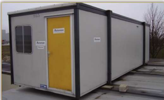
Portable Cabins & Containers