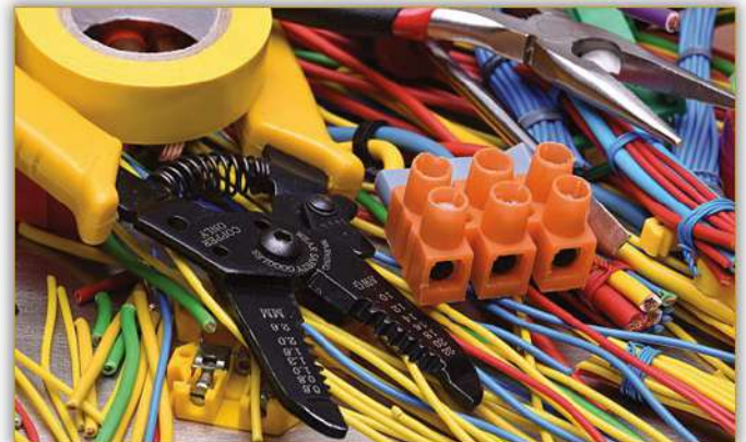
Electrical & Instrument Material